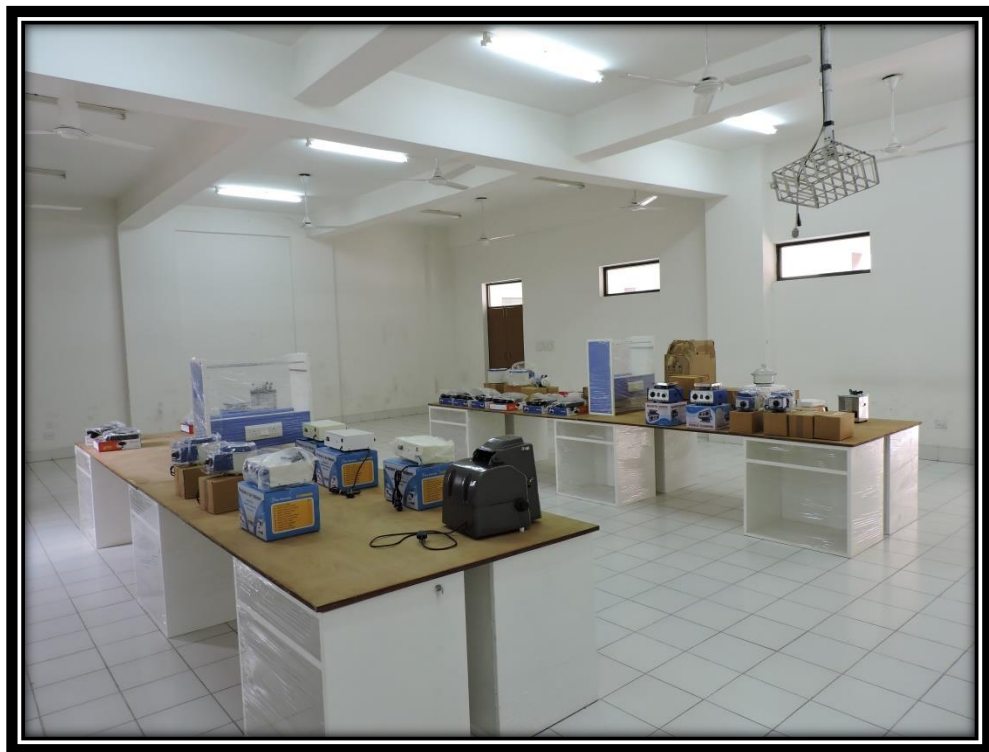
Pharmaceutical Analysis Lab, Faculty of Pharmaceutical Sciences