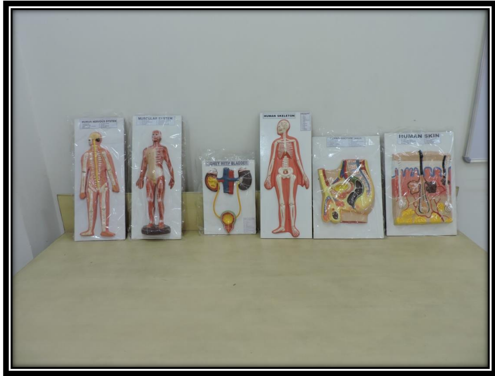
Museum, Faculty of Pharmaceutical Sciences