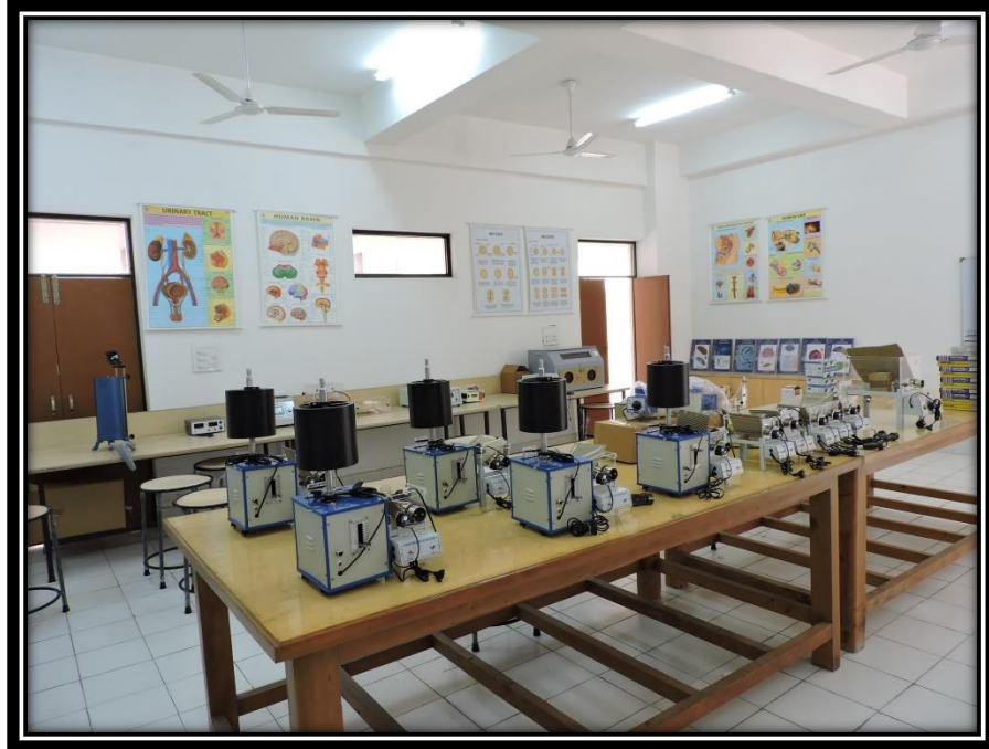
Human Anatomy & Physiology Lab