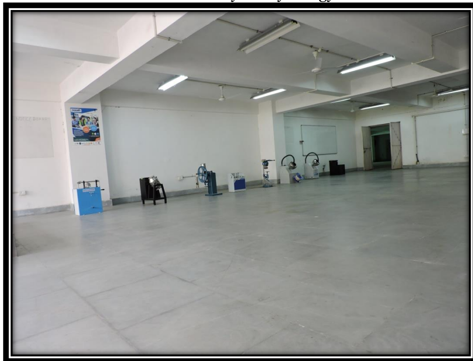
Machine Room, Faculty of Pharmaceutical Sciences